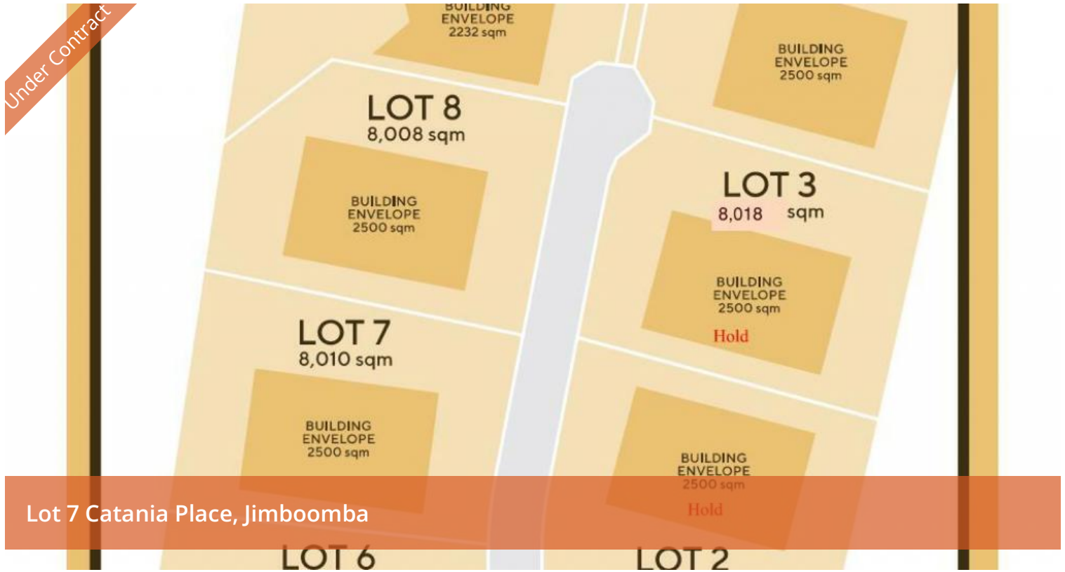
Lot 7 Catania Place, Jimboomba