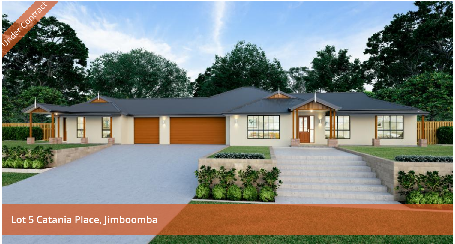
Lot 5 Catania Place, Jimboomba