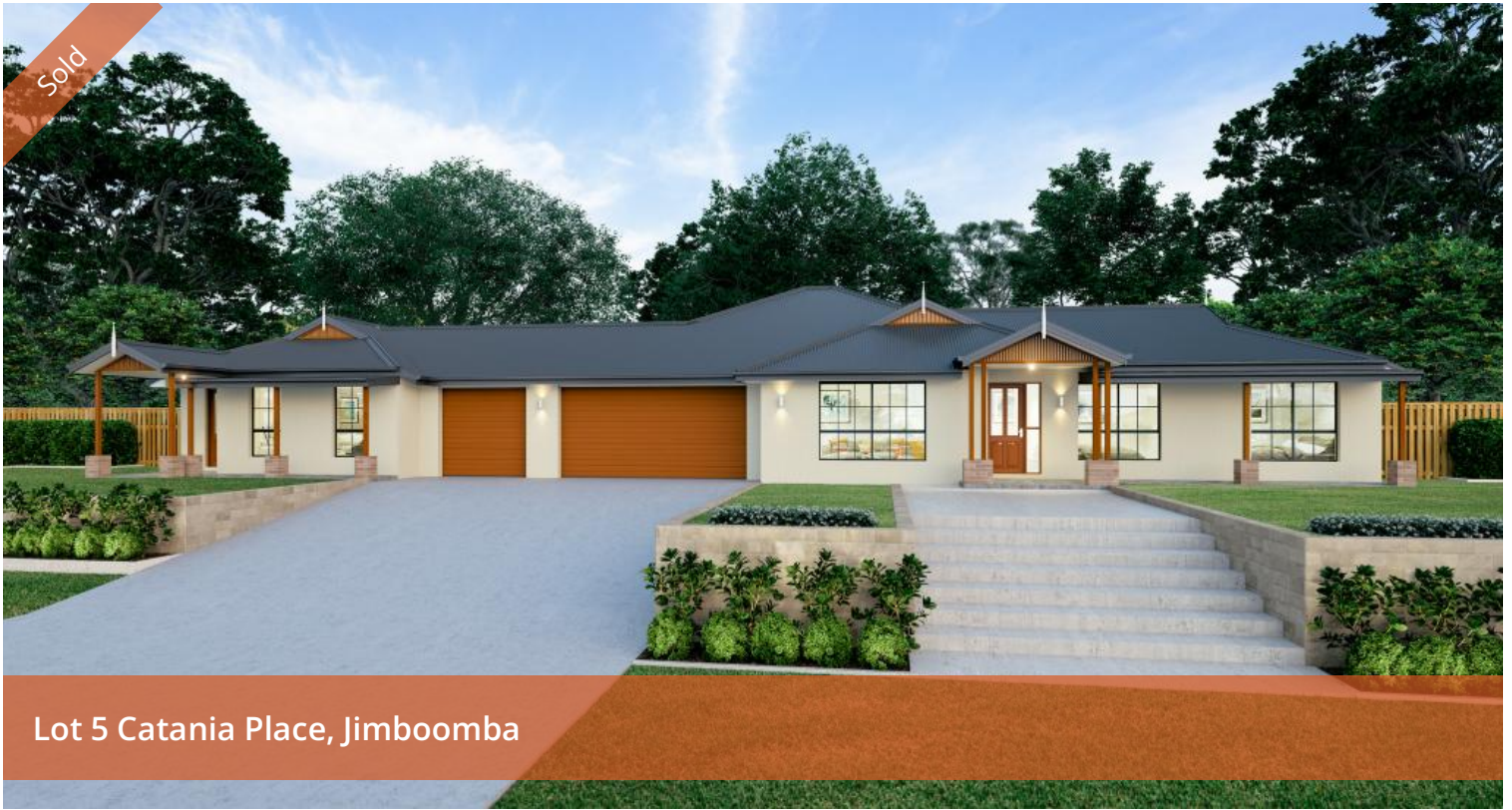
Lot 5 Catania Place, Jimboomba