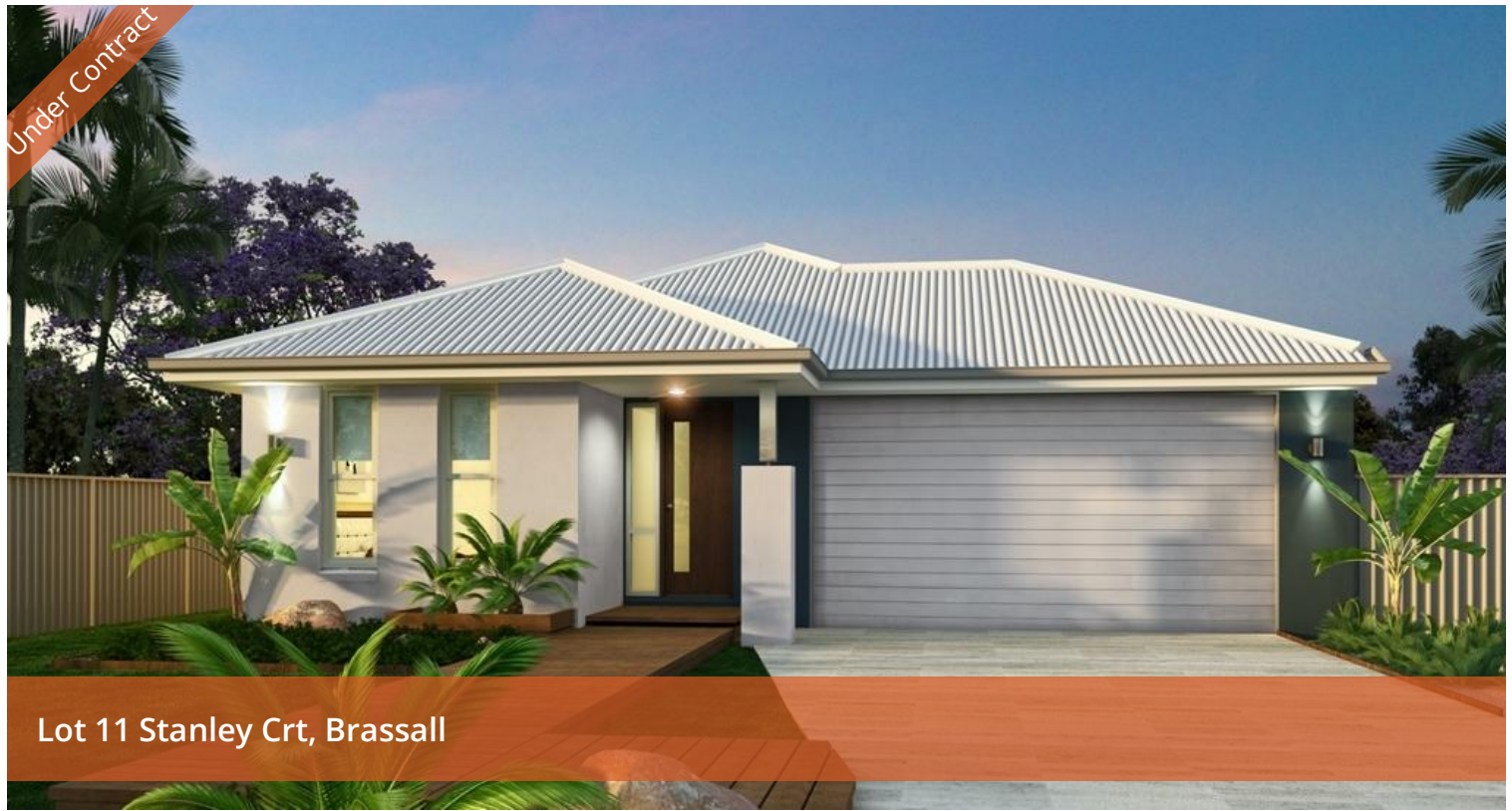
Lot 11 Stanley Crt, Brassall