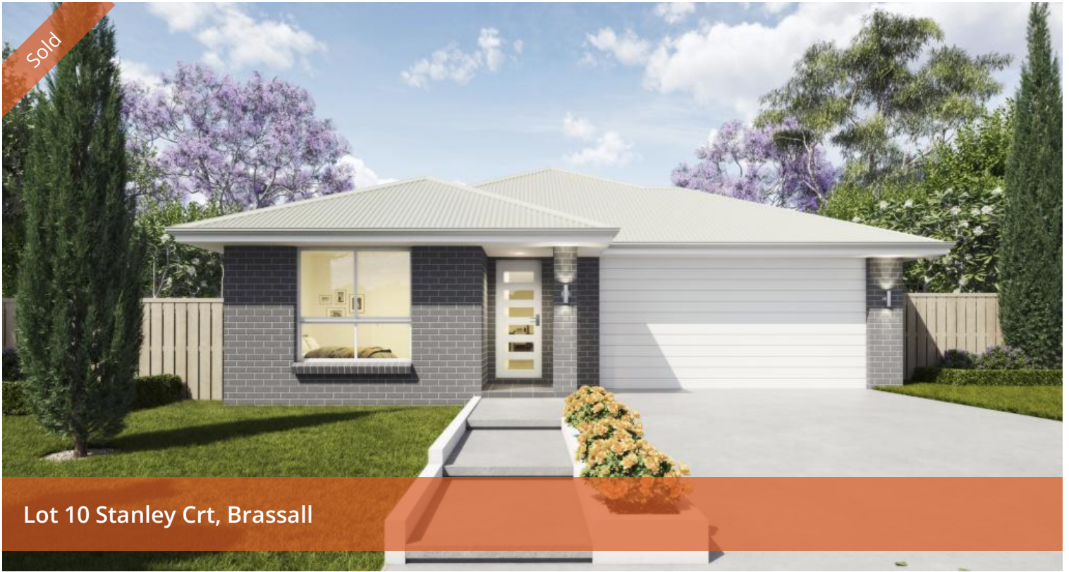
Lot 10 Stanley Crt, Brassall